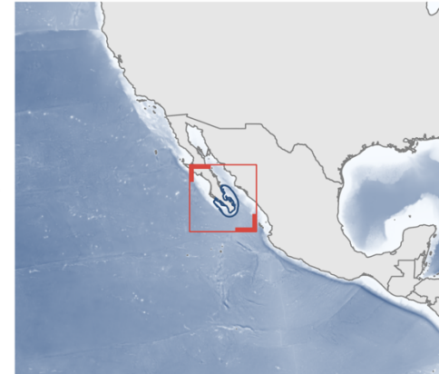
Blue lines indicate the area meeting the ISRA Criteria; dashed lines indicate the suggested buffer for use in the development of appropriate place-based conservation measures