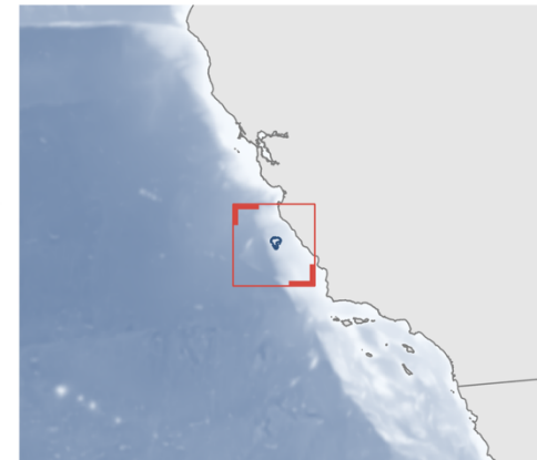
Blue lines indicate the area meeting the ISRA Criteria; dashed lines indicate the suggested buffer for use in the development of appropriate place-based conservation measures