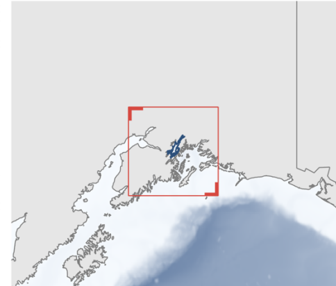
Blue lines indicate the area meeting the ISRA Criteria; dashed lines indicate the suggested buffer for use in the development of appropriate place-based conservation measures